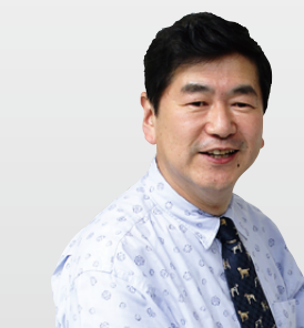
NPO Orthotics Society Director M.D. (Orthopedist), Director of the SMSF, Councilor of the JSSF

-Is there a solution other than surgery for feet trouble?- NPO Orthotics Society has started from this passion.